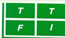
TABLE TENNIS FEDERATION OF INDIA